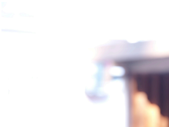
009 'Organic Matter' - Abstraction 2025