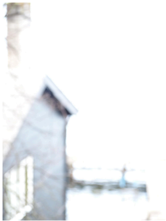
005 'Organic Matter' - absence - presence 2025