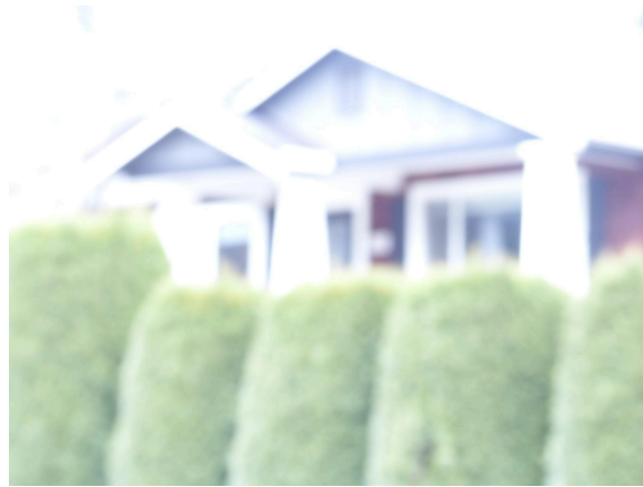
008 'Organic Matter' - geometrical forms and nature 2025