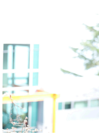
006 'Organic Matter' - geometrical forms and nature 2025