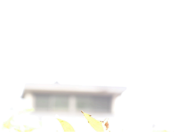
007 'Organic Matter' - geometrical forms and nature 2025